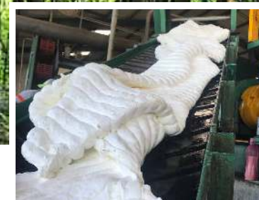
After removing impurities, formic acid helps to coagulate the sap into a workable consistency.