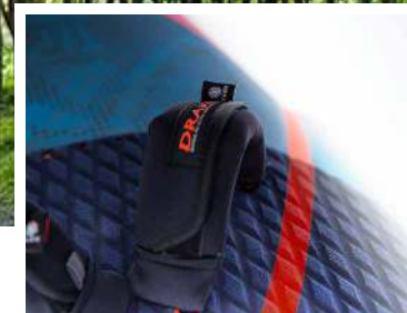
Brought to the facilities in Thailand, the sheets are die cut and manufactured into new footstraps. During 2020 season all boards will come with the Yulex foot straps.