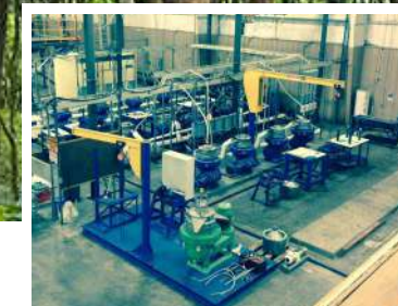
The coagulated rubber runs through the final step before becoming sheets of Yulex certified foam.