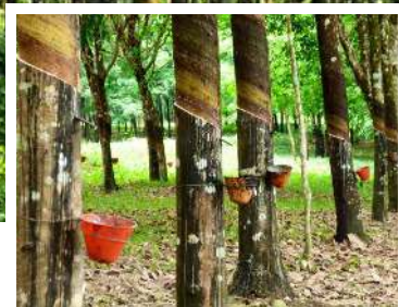
With a thin diagonal cut the bark is removed. Over six hours the sap drips out, like blood. A couple of days later when the tree has recovered, the procedure repeats.