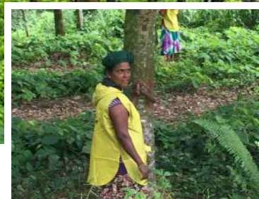
Sustainably and responsibly grown in Guatemalan and Sri Lankan plantations, certified by the Forest Stewardship Council (FSC).